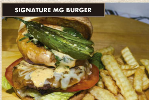
SIGNATURE MG BURGER