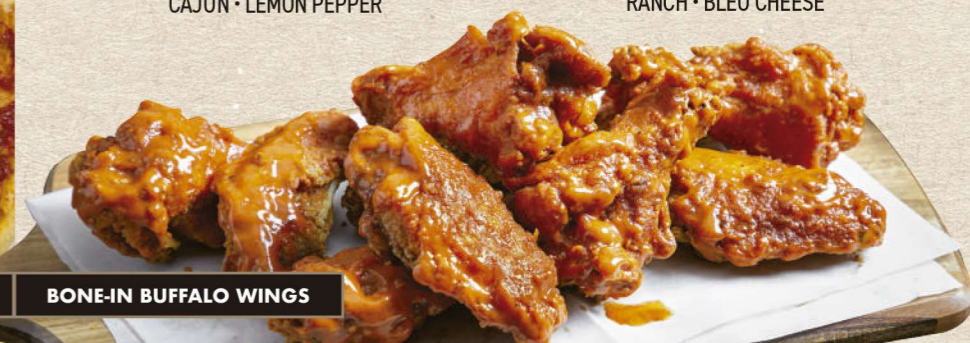
BONE-IN BUFFALO WINGS