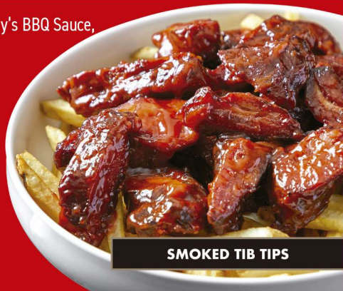
SMOKED TIB TIPS

SMALL ..... 13.99 MEDIUM ..... 24.99 LARGE ..... 35.99